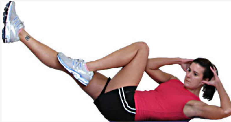
Bicycle Exercise for Abs

Want to know the most effective ab exercises? The following ab exercises are the results of the American Council on Exercise's study to determine the most effective ab exercises. While ab exercises won't spot reduce fat from the belly, strong abs are important for keeping your body healthy and protecting your spine. For more about flat abs, visit my Abs Page for articles, workouts, FAQs and more.